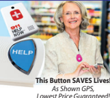
This Button SAVES Lives!

GPS Tracking w/Fall Detection Nationwide, No Land Line Needed EASY Set-up, NO Contract 24/7 365 Monitoring in the USA