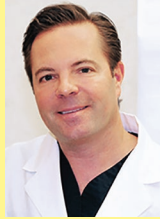
Your Catholic Dermatologist