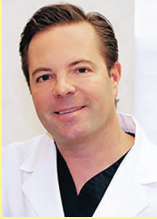
Your Catholic Dermatologist

For more information go to www.usccb.org/respectlife