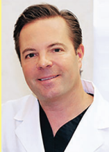
Your Catholic Dermatologist

For more information go to www.usccb.org/respectlife