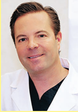
Your Catholic Dermatologist

For more information go to www.usccb.org/respectlife