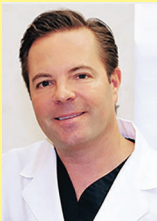
Your Catholic Dermatologist

For more information go to www.usccb.org/respectlife