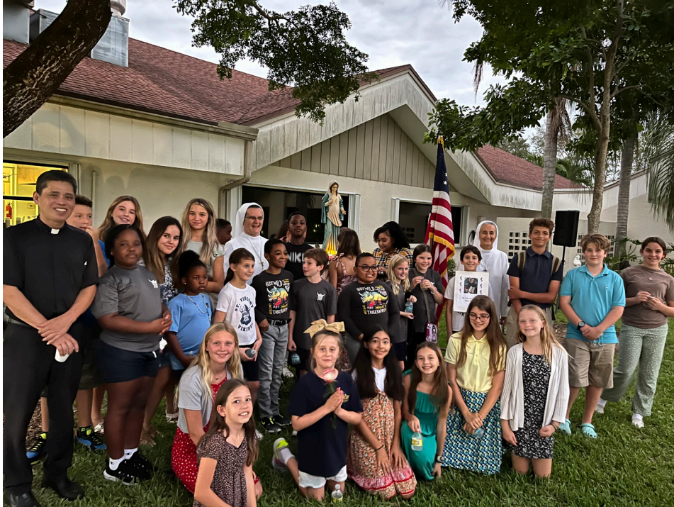
Students from St. Vincent Ferrer Catholic School led the Holy Rosary