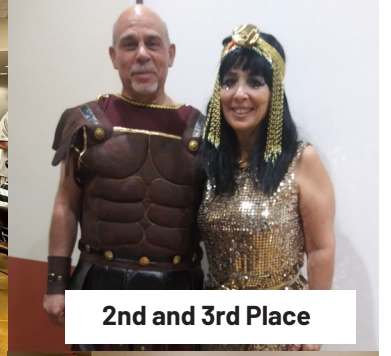
2nd and 3rd Place