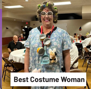
Best Costume Woman