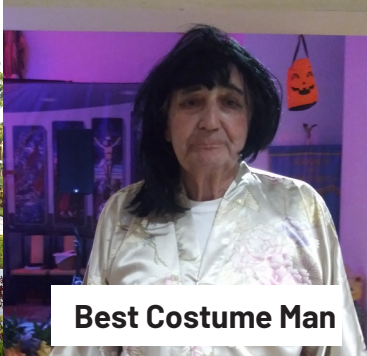
Best Costume Man