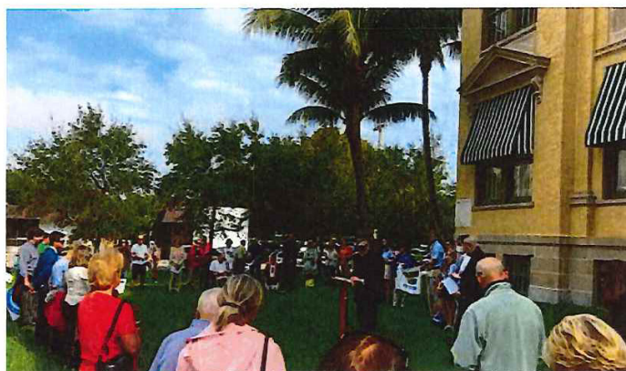
Rosary hosted by: