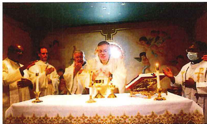
Mass & Procession hosted by: