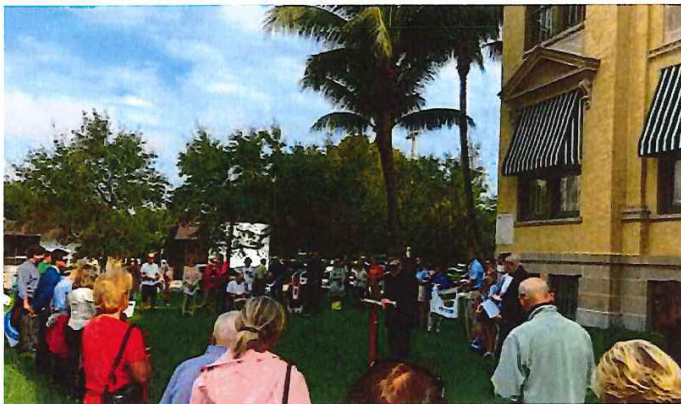
Rosary hosted by: