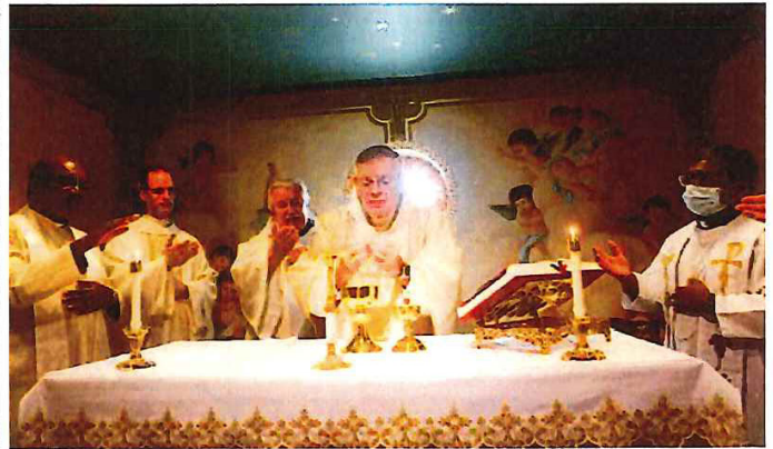
Mass & Procession hosted by: