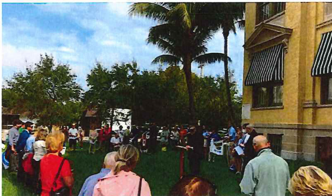
Rosary hosted by:

3115 45th Street West Palm Beach, FL 33407