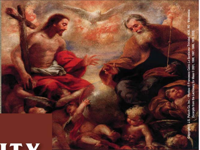
Copyright © J.S. Paluch Co., Inc. - Photos: © Francesco Cairo La Santissima Trinità, 1630, PD - Wikimedia Excerpts from the Lectionary for Mass © 2001, 1997, 1986, 1970, CCD.