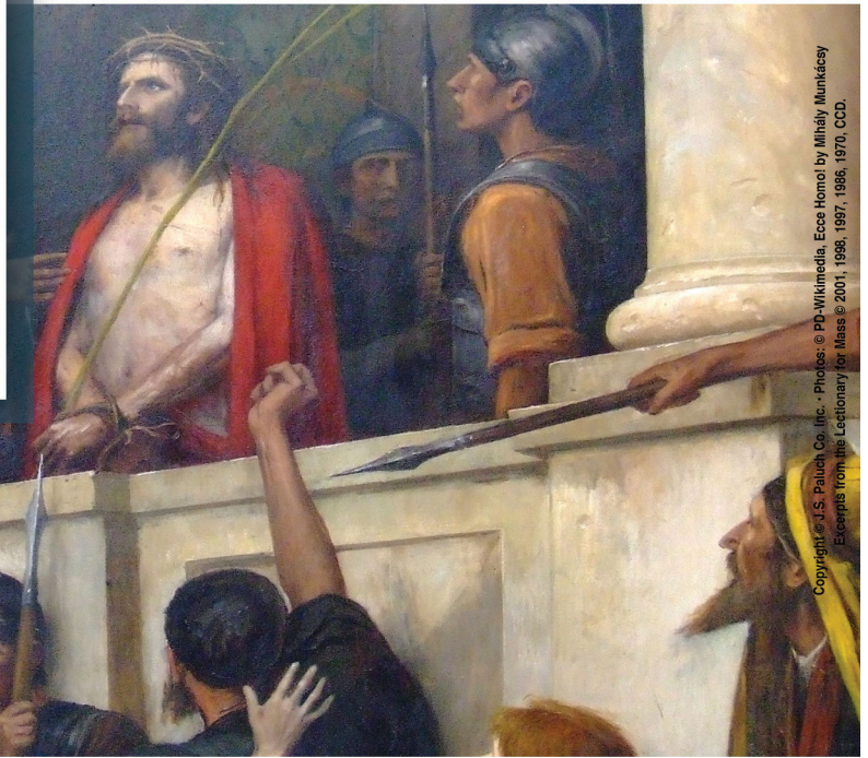
Copyright © J.S. Paluch, Co., Inc. - Photos: © PD-Wikimedia, Ecce Homo by Mihály Munkácsy Excerpts from the Lectionary for Mass © 2001, 1998, 1997, 1986, 1970, CCD.