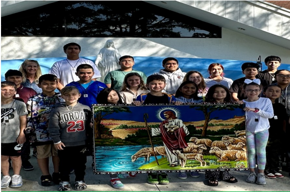
CCD Reconciliation Group Retreat