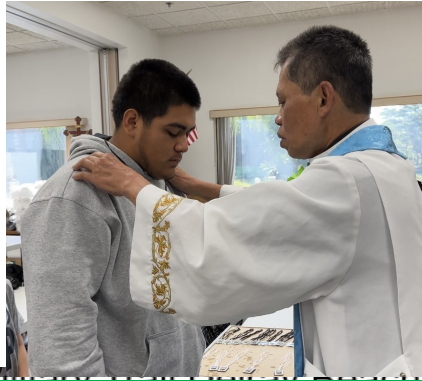
Blessing the scapulars