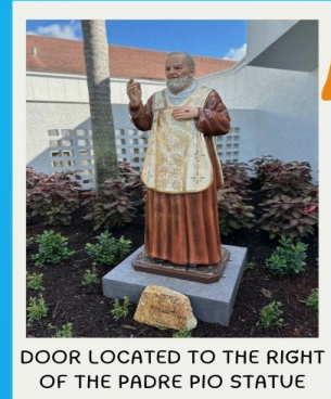
DOOR LOCATED TO THE RIGHT OF THE PADRE PIO STATUE

"The glory of God is man fully alive." - ST. IRENAEUS OF LYONS