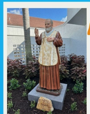
DOOR LOCATED TO THE RIGHT OF THE PADRE PIO STATUE

“The glory of God is man fully alive.” - ST. IRENAEUS OF LYONS